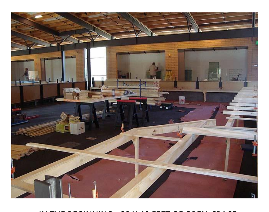
IN THE BEGINNING - 32 X 40 FEET OF OPEN SPACE

Ground breaking in February, 2010 for the Model Railroad Building became the fulfillment of a ten year dream for the park staff and the three clubs, Sun-N-Sand, SMRHS and Paradise & Pacific O gauge. The building was nearly complete when it was briefly opened to the clubs and the public for Rail Fair in October, 2010. Over 4,000 people visited the building over two days. Then the building remained closed for three months while contractors completed their work and the three clubs began their layout construction. January, 2011 saw the dedication of the Model Railroad Building and its formal public opening. Over 150,000 park visitors enjoyed the sights and sounds of the model railroads, displays and videos in the first twelve months.