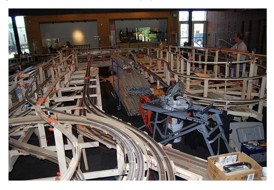
A LOT OF TRACK - NOT MUCH SCENERY

Ground breaking in February, 2010 for the Model Railroad Building became the fulfillment of a ten year dream for the park staff and the three clubs, Sun-N-Sand, SMRHS and Paradise & Pacific O gauge. The building was nearly complete when it was briefly opened to the clubs and the public for Rail Fair in October, 2010. Over 4,000 people visited the building over two days. Then the building remained closed for three months while contractors completed their work and the three clubs began their layout construction. January, 2011 saw the dedication of the Model Railroad Building and its formal public opening. Over 150,000 park visitors enjoyed the sights and sounds of the model railroads, displays and videos in the first twelve months.